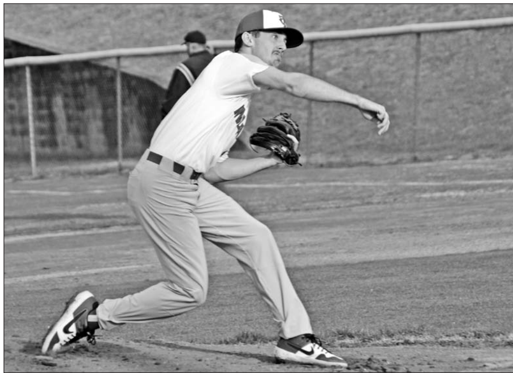
The Towns County pitching staff has posted an impressive 2.67 ERA this season with 42 strikeouts in 34 innings pitched.

Overall, Fullerton pitched four and a third innings, throwing 75 pitches and only giving up two hits, three